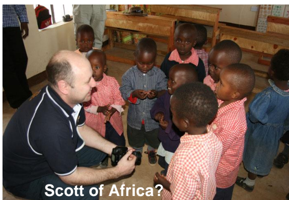
Scott of Africa?

In order to bring everyone up to date as best as possible this is a rough timeline surrounding the main group visits to date.